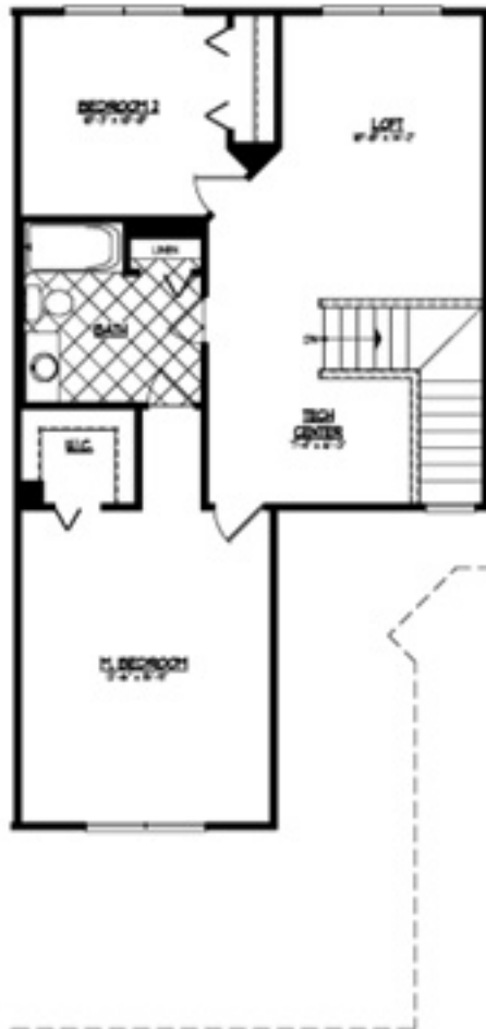
SECOND FLOOR PLAN SCALE: 1/4" = 1'-0"