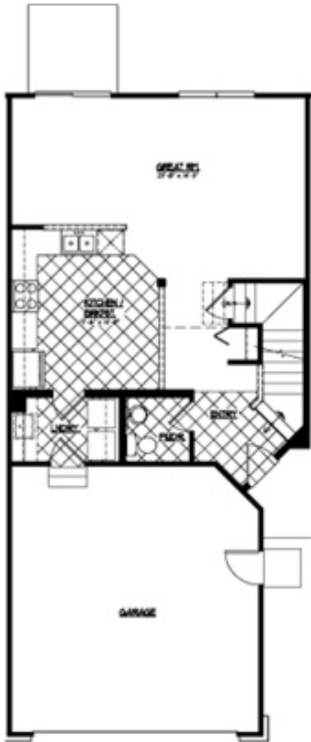
FIRST FLOOR PLAN SCALE: 1/4" = 1'-0"